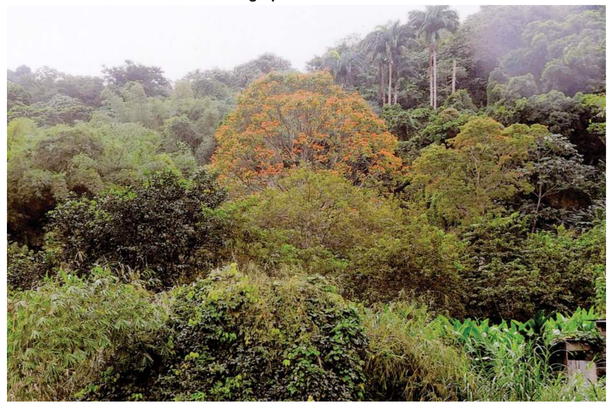
Photograph B for Question 4